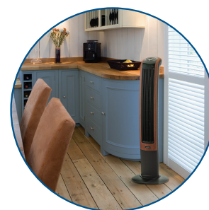
Louvered Air Flow Control