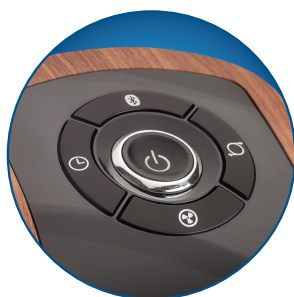
3 Quiet Comfort Settings and 7-Hour Timer