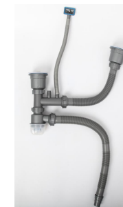
With stainless steel drainer kit, 50mm diameter pipe for one bowl, 110-