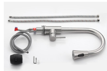
With stainless steel pull out faucet WFPU2331